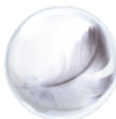
Foaming Resin Systems