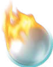
Fire Retardant Systems