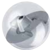
BÜFA Tec Machine Technology