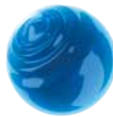
Release Agents, Additives & Ancillaries