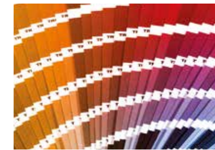
An unlimited range of colours