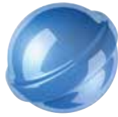
Gelcoats & Topcoats