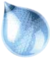
UP- & VE-Resins, Epoxy Resin Systems