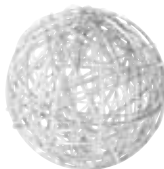
Reinforcements, Core & Non-woven Materials